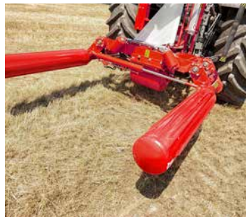
Easy and gentle self-loading of the bales – the bale is gently lifted by the rollers.