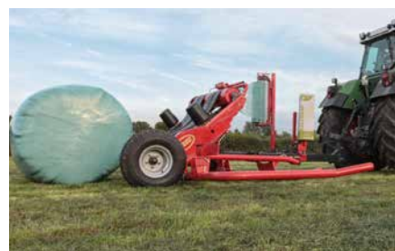
Low design of the machine ensures fast and gentle unloading of the bale.