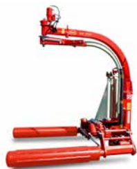
Vicon BW2250 Satellite wrapper, mounted Max bale size: 1.20x1.50m