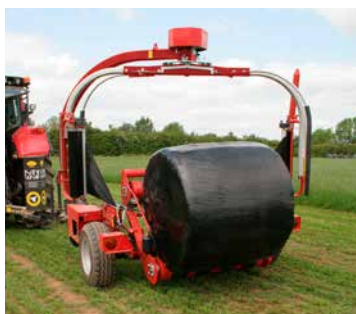
Fast and gentle unloading of bales with no need for a drop mat.