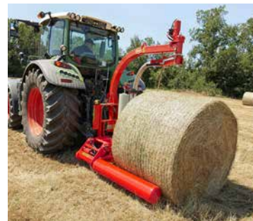
The BW2250 has a self-loading mechanism to gently load and unload the bales.