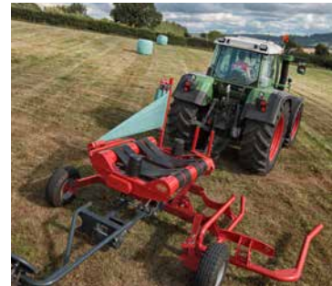
Turntable with two driven rollers designed for a high bale stability and smooth even rotation.