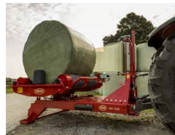
Able to handle round balers up to 1200 kg.