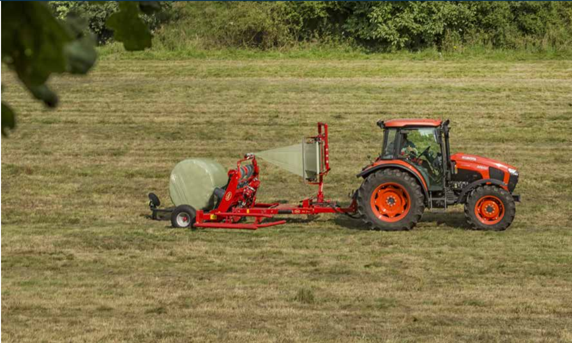
The loading arm is powered fully down to lift the wheel off the ground for easy movement from work to transport.