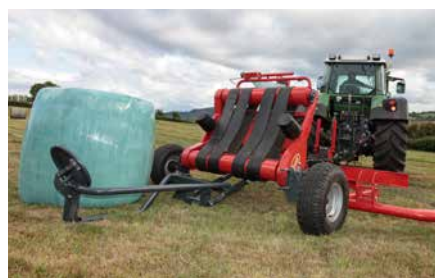
The Vicon Turntable wrappers can be fitted with a bale on end kit.

The wide spacing of the wheels has allowed an exceptionally low mounting position for the turntable. This allows the table to be tilted downwards until it nearly touches the ground, reducing drop height when unloading bales, ensuring the gentlest possible handling of the wrapped bale. This reduces the chance of film damage and eliminates the need for a fall damper or drop mat in normal conditions.