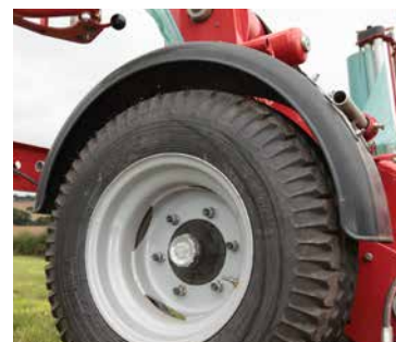
Mud guards reduce mud and dirt building up on the pre-stretcher and film rolls when operating in soft ground field and during transport.