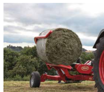
Hydraulically operated loading arm, and a low loading height, provides fast transfer of bale from arm to turntable.

The clever design of the frame with its extendable wheel arm on the right hand side allows an increase in track width on the field for maximum stability during loading of bales. The hydraulically operated loading arm is positioned on the right hand side and can handle bales up to 1000 kg with 1.20m up to 1.50m diameter.