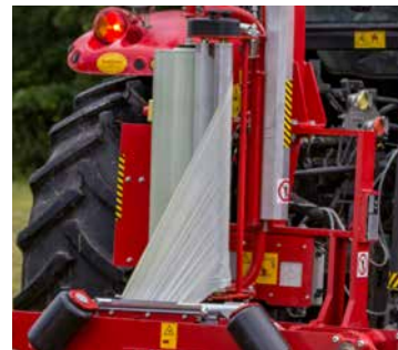
Hydraulic film cutter.