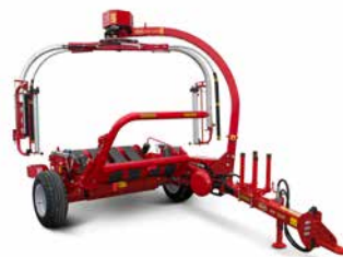
Vicon BW2850 Satellite wrapper, trailed Max bale size: 1.20x1.50m