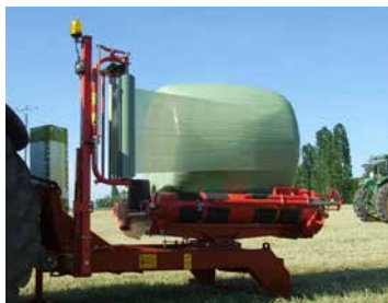
Bale and wrap counter is standard.

“ Optional remote control – for easy handling”