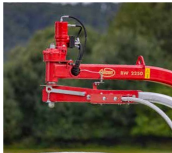
Strong satellite driveline.