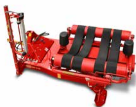
Vicon BW2100 Turntable wrapper, mounted Max bale size: 1.20x1.50m