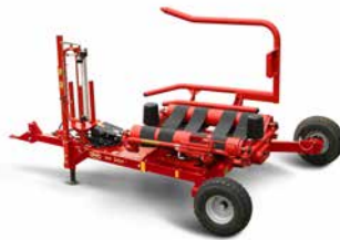
Vicon BW2400 Turntable wrapper, trailed Max bale size: 1.20x1.50m