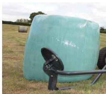
The Vicon BW2850 can be fitted with a bale on end kit.