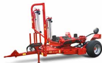
Vicon BW2600 Turntable wrapper, trailed Max bale size: 1.20x1.50m